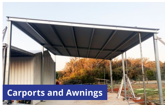
Carports and Awnings