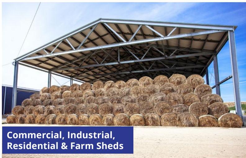
Commercial, Industrial, Residential & Farm Sheds

Superior Shed Systems can design and build a range of products including: