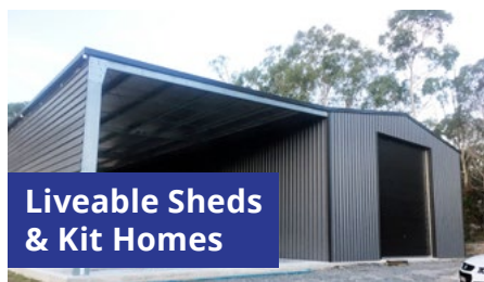
Liveable Sheds & Kit Homes